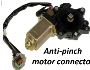
Anti-pinch motor connector

Safety feature to reduce the chance of injury to passengers!